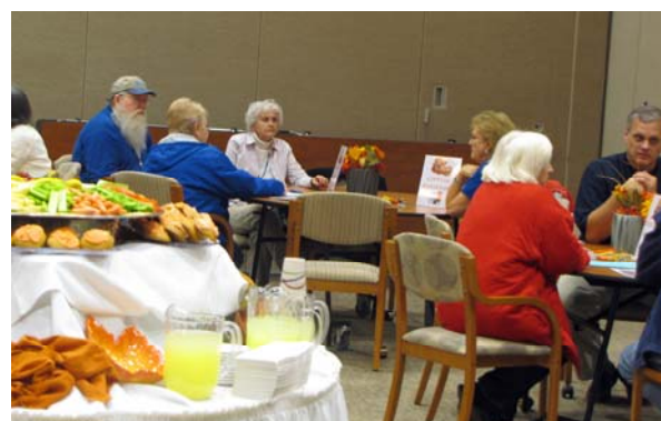
Volunteer gather at last spring's open house to learn about volunteer opportunities with the Council for Older Adults.